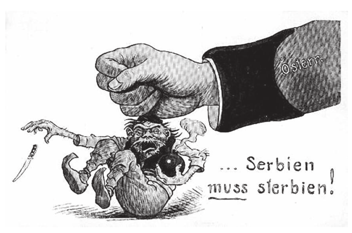
An Austrian cartoon published shortly after the assassination of Archduke Ferdinand. The words say 'Serbia must die!' 'Osterr' means Austria.