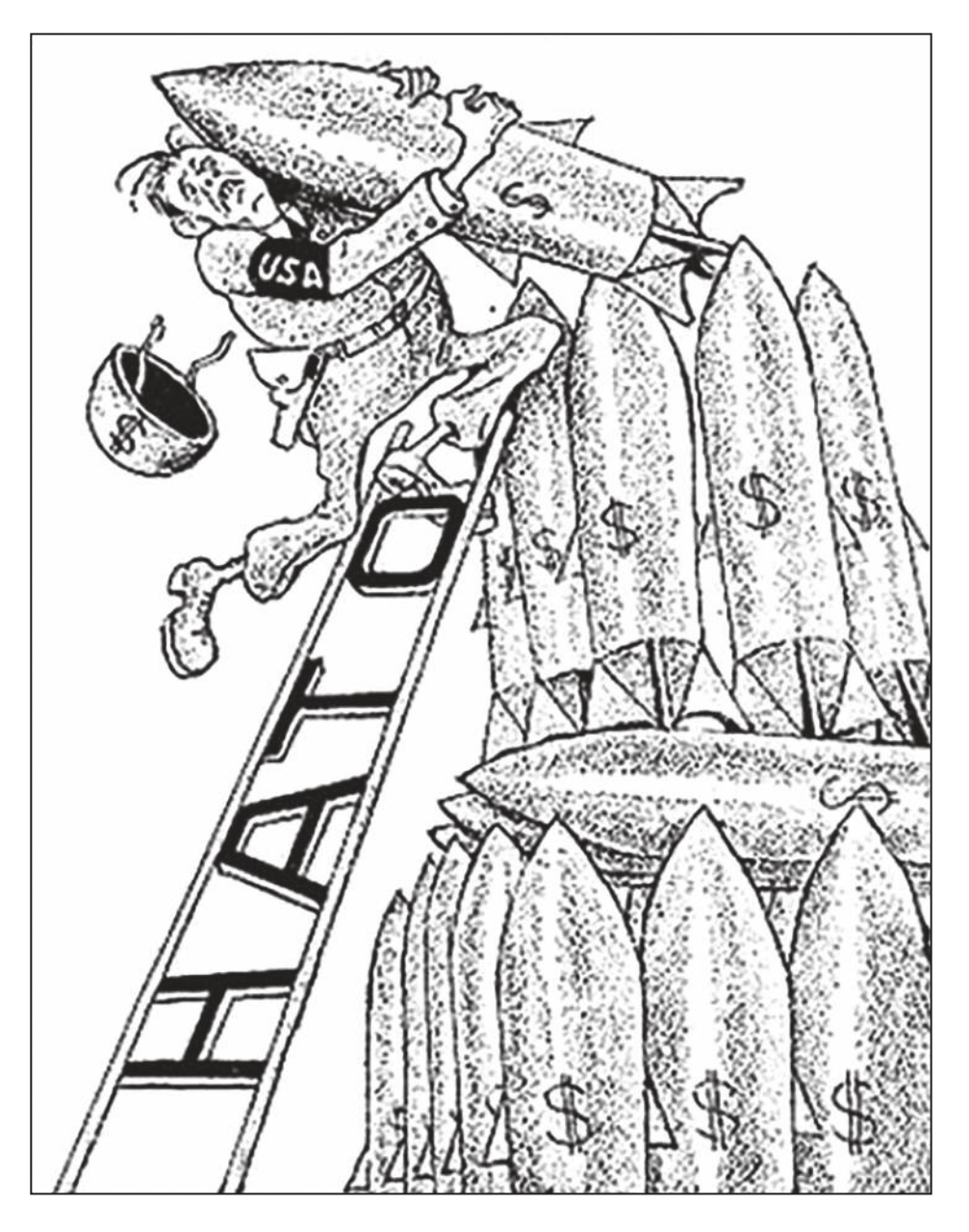
A cartoon published in the Soviet Union in 1949. The word on the ladder is 'NATO'.